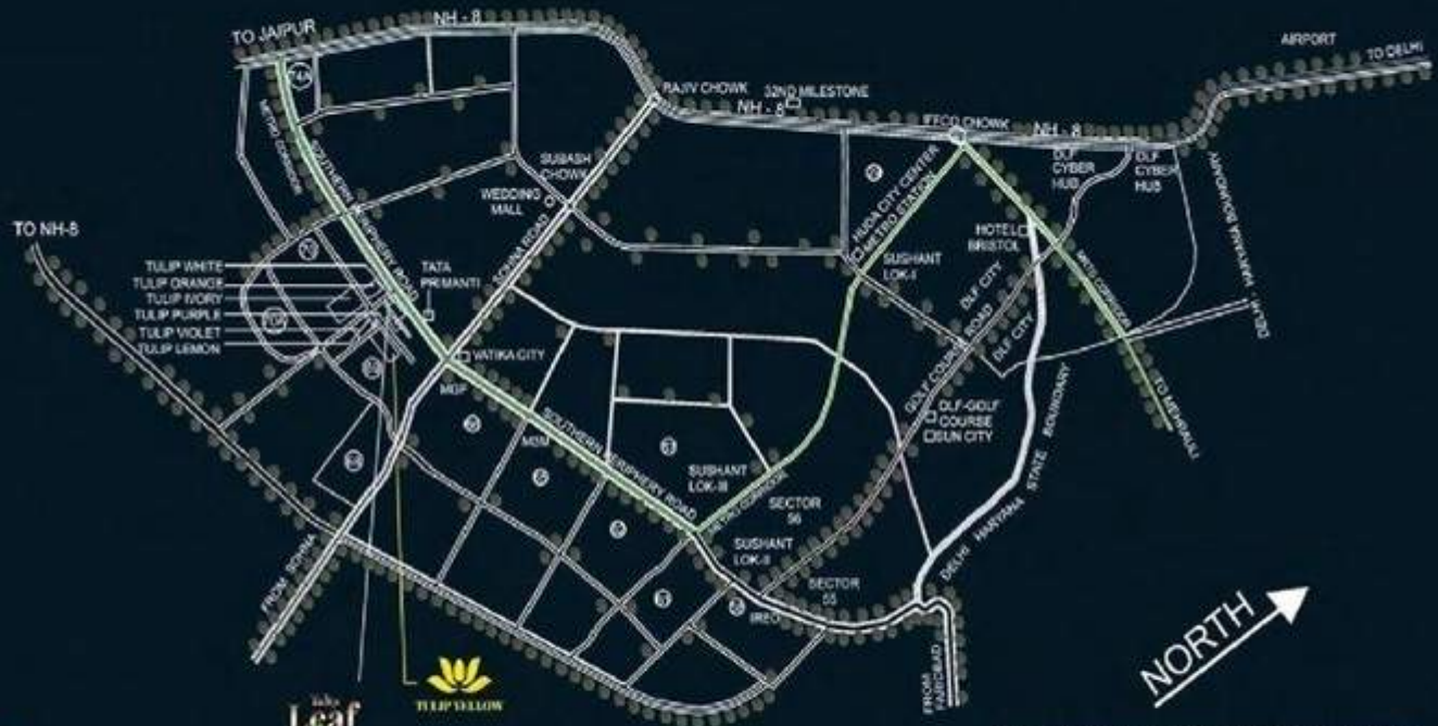
PROPOSED MAP . NOT TO SCALE ONLY FOR INDICATION