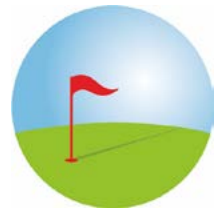
Golf Putting Greens Area