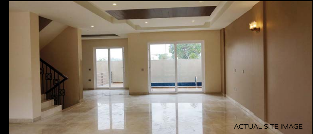
ACTUAL SITE IMAGE