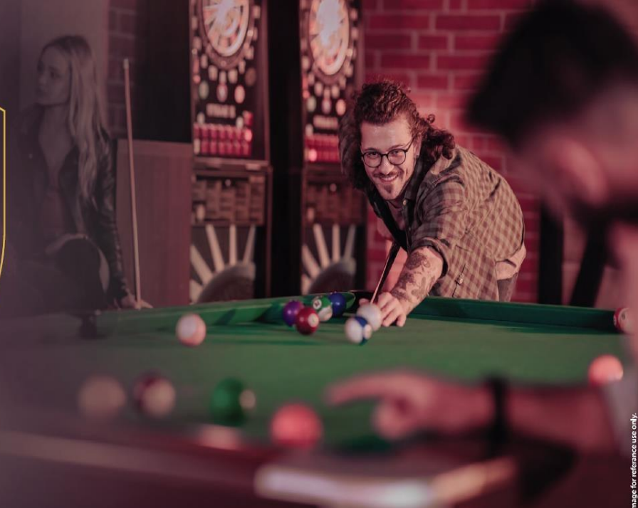
Image for reference use only.

Show off your skills at the pool table to your friends or practice by yourself to get better.