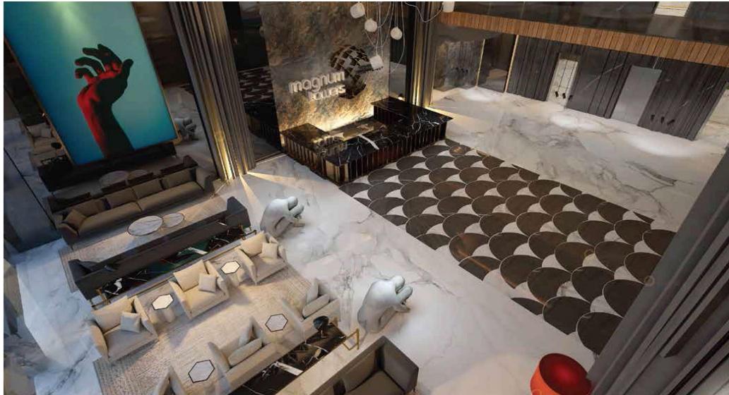
Actual 3D rendered image (Tower 1 lobby)