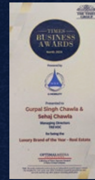
Luxury Brand of the Year at Times Business Awards, North 2024