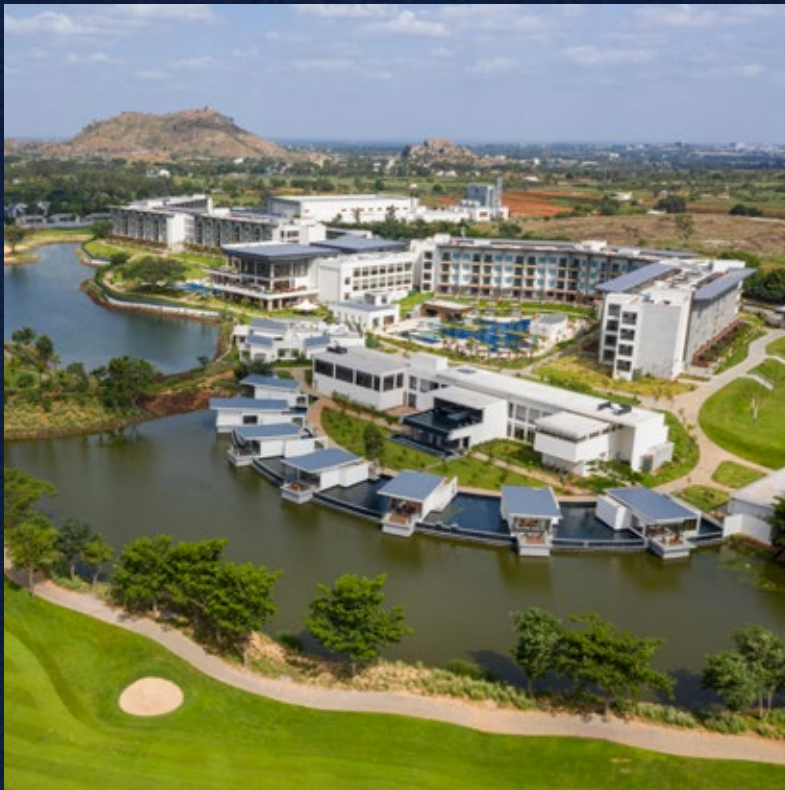
JW MARRIOTT PRESTIGE GOLFSHIRE RESORT & SPA BENGALURU

Coopers Hill is an international landscape architecture, urban design, landscape planning and master planning consultancy, with offices in Singapore, Bangkok, Bali, Shanghai, Ho Chi Minh City and Dubai. With a culturally sensitive and responsible approach to the natural environment and a belief that every site possesses its intrinsic qualities, Coopers Hill has been creating unique, timeless and award-winning landscape design for over 40 years.