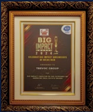
Emerging Real Estate Brand at Big Impact Awards 2024 by BIG FM