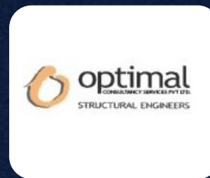
Structure Peer Review Consultant