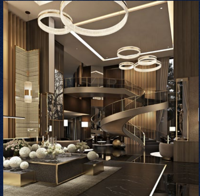
CENTRAL PARK BELLAVISTA, GURUGRAM