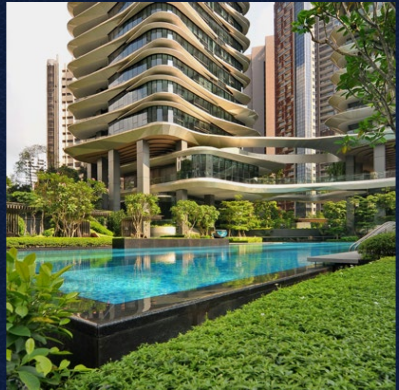
NEW FUTURA SINGAPORE