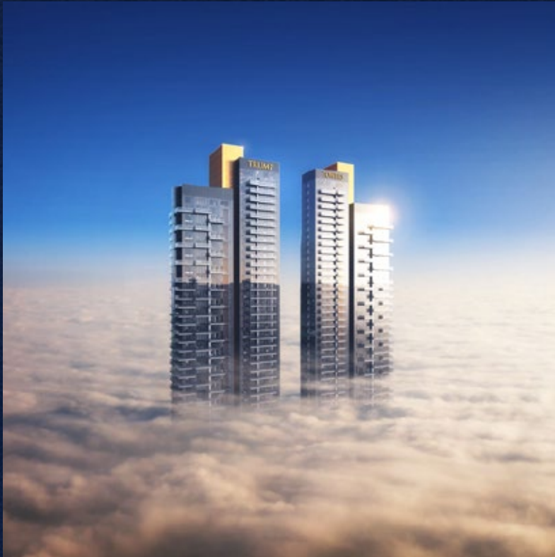
TRUMP TOWERS GURUGRAM

Morphogenesis is a global design leader with a proven track record of delivering over 250 Mn. Sq. Ft. of exceptional projects across 50 cities in 8 countries. The firm offers comprehensive services encompassing master planning, residential, commercial, workplace, institutional, hospitality, and houses. Its in-house expertise in interiors, landscape, digital technologies, and design management ensures integrated and holistic solutions.