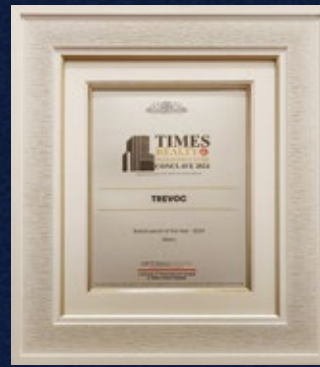
Brand Launch of the Year at Times Realty & Infrastructure Conclave 2024