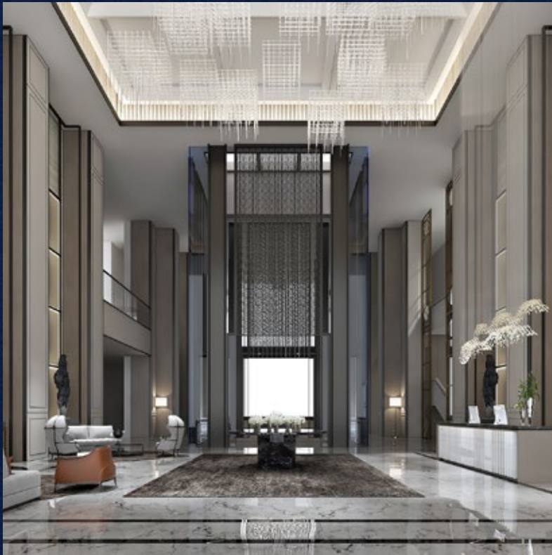
THE AMARYLLIS CLUB, CENTRAL DELHI

Habitat Architects is a multidisciplinary design firm specialising in comprehensive and luxury architecture, interior design, master planning, landscape, and product design services. As design innovators deeply committed to creating exceptional spaces, they provide a revolutionary approach to contemporary trends in design and construction. Their repertoire spans master planning, resorts and hotels, high-rise luxury residences, commercial and institutional buildings, and private homes, across several continents.