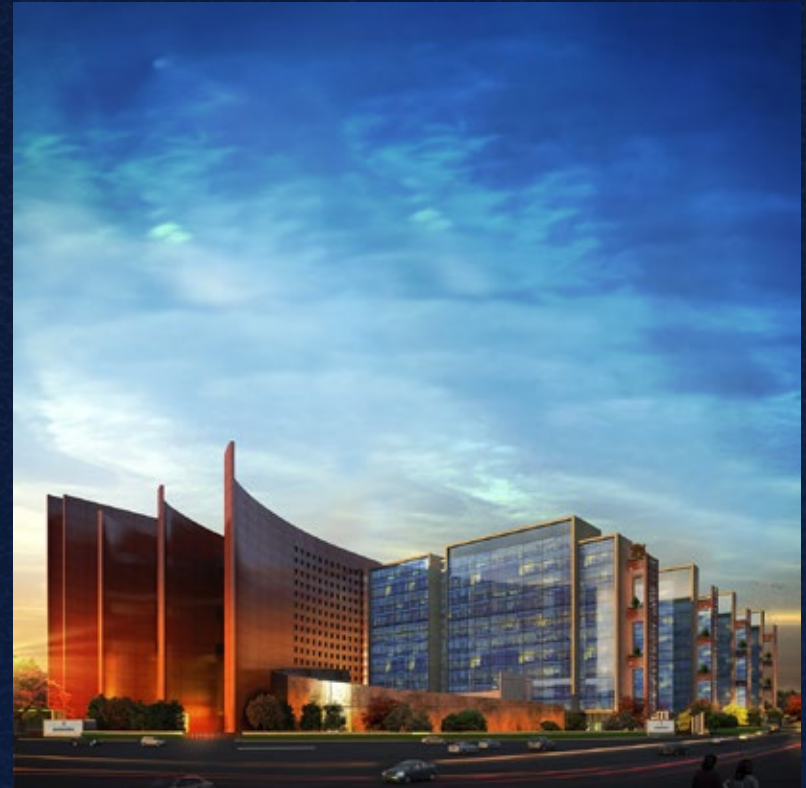
SURAT DIAMOND BOURSE SURAT, GUJARAT