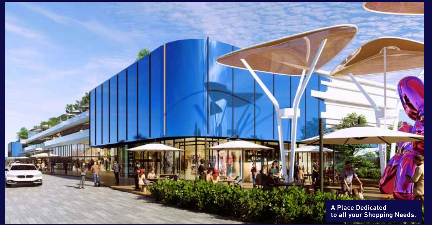
A Place Dedicated to all your Shopping Needs.