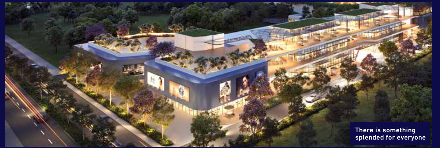
There is something splended for everyone