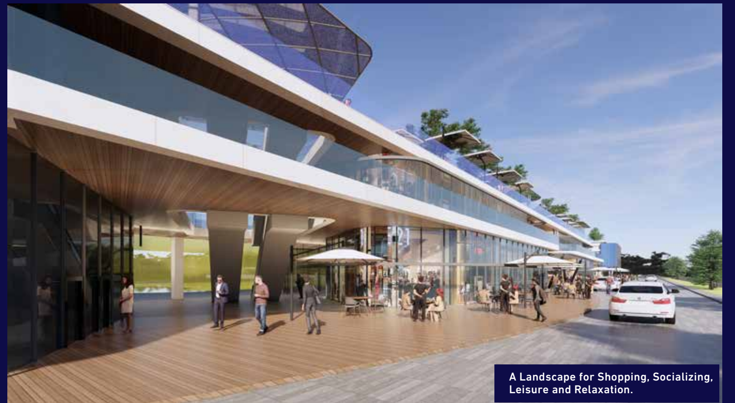
A Landscape for Shopping, Socializing, Leisure and Relaxation.