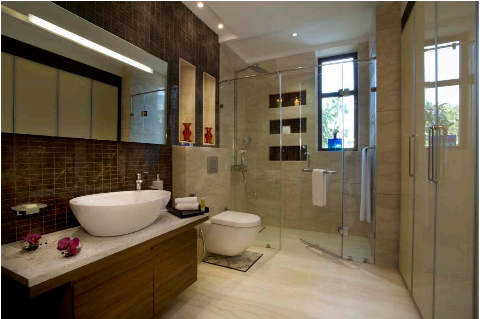
Actual sample flat image