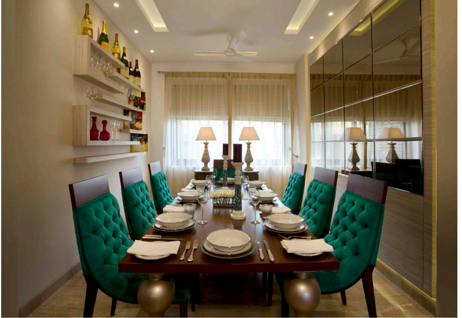
Actual sample flat image