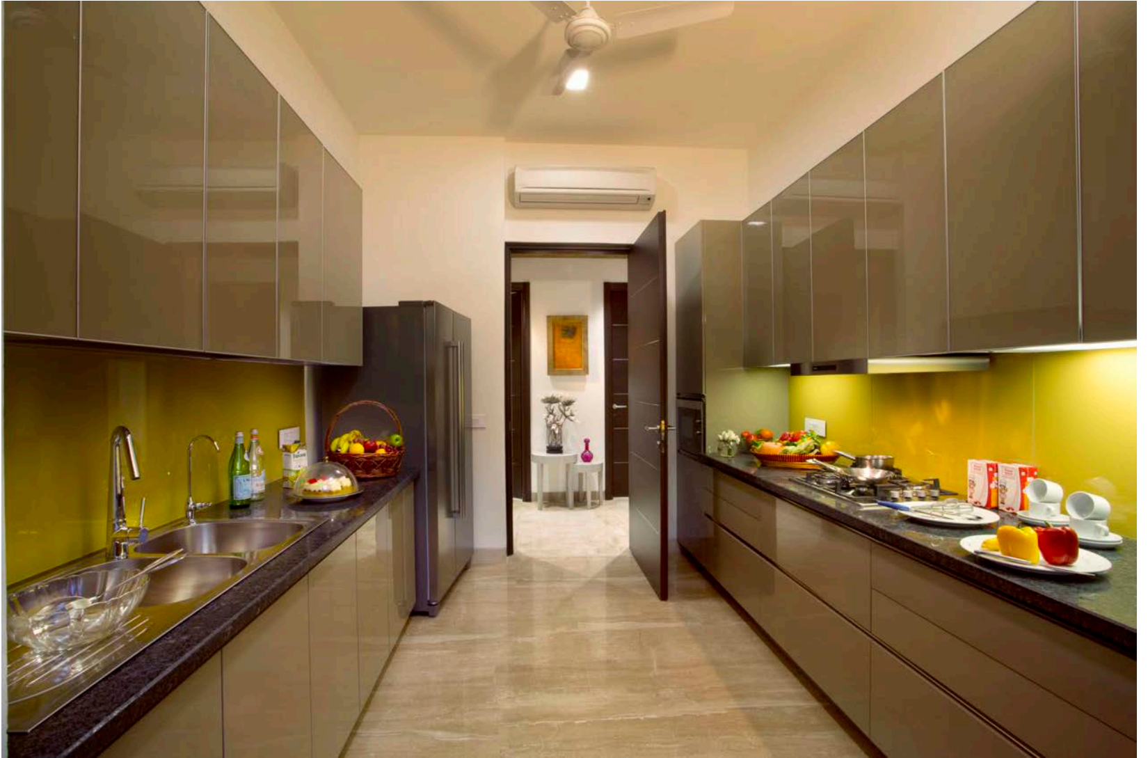
Actual sample flat image