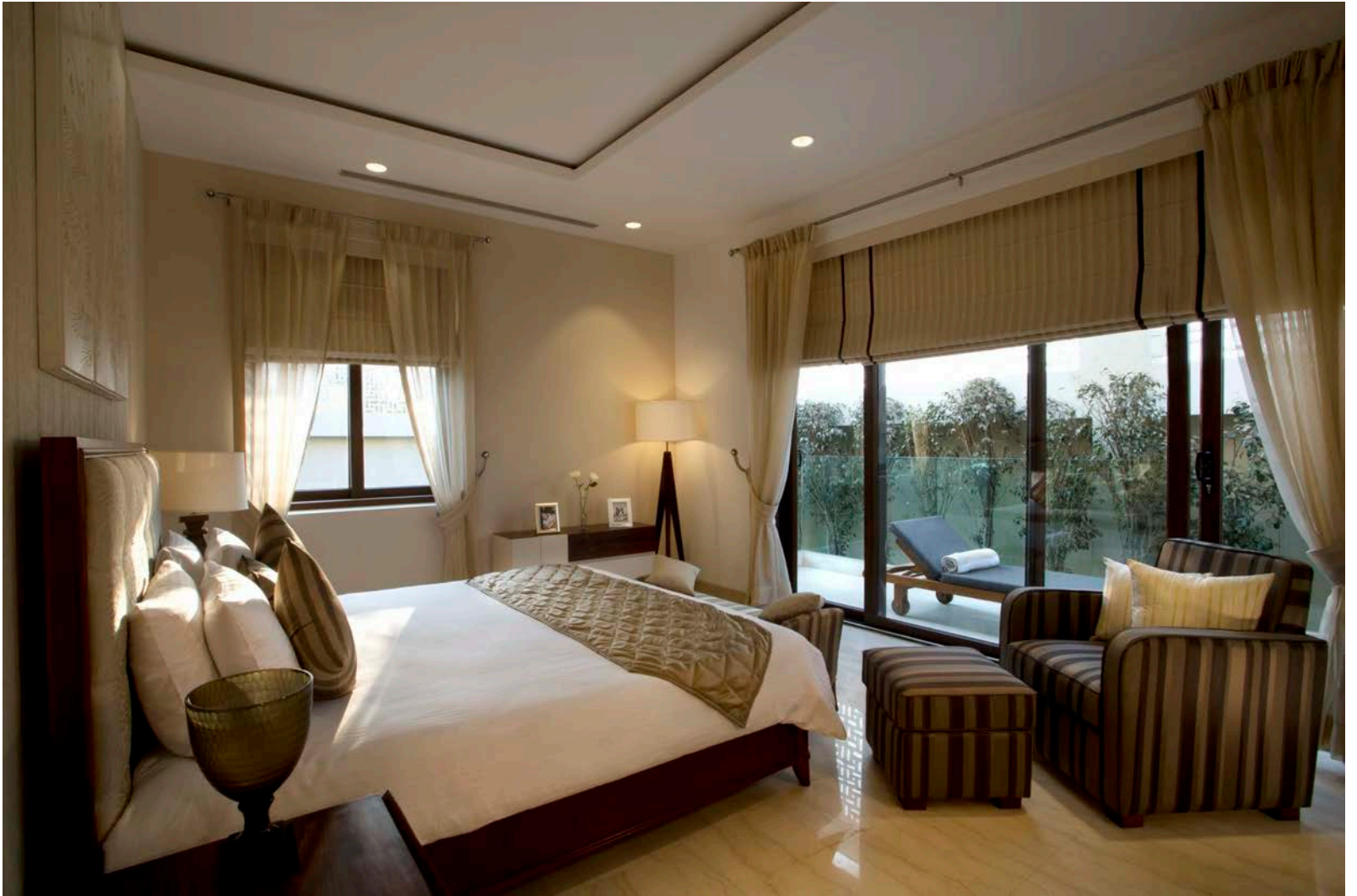
Actual sample flat image