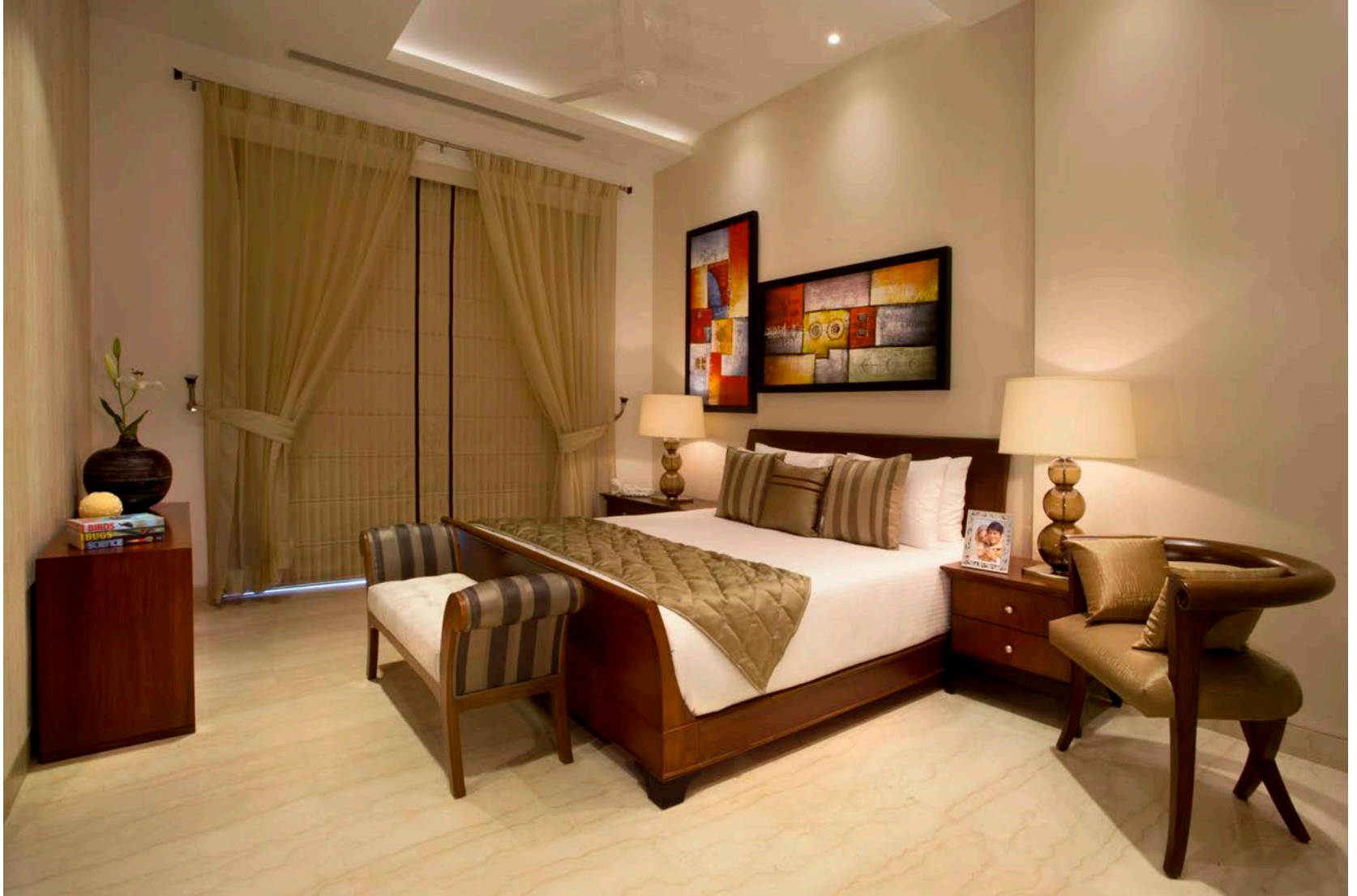
Actual sample flat image