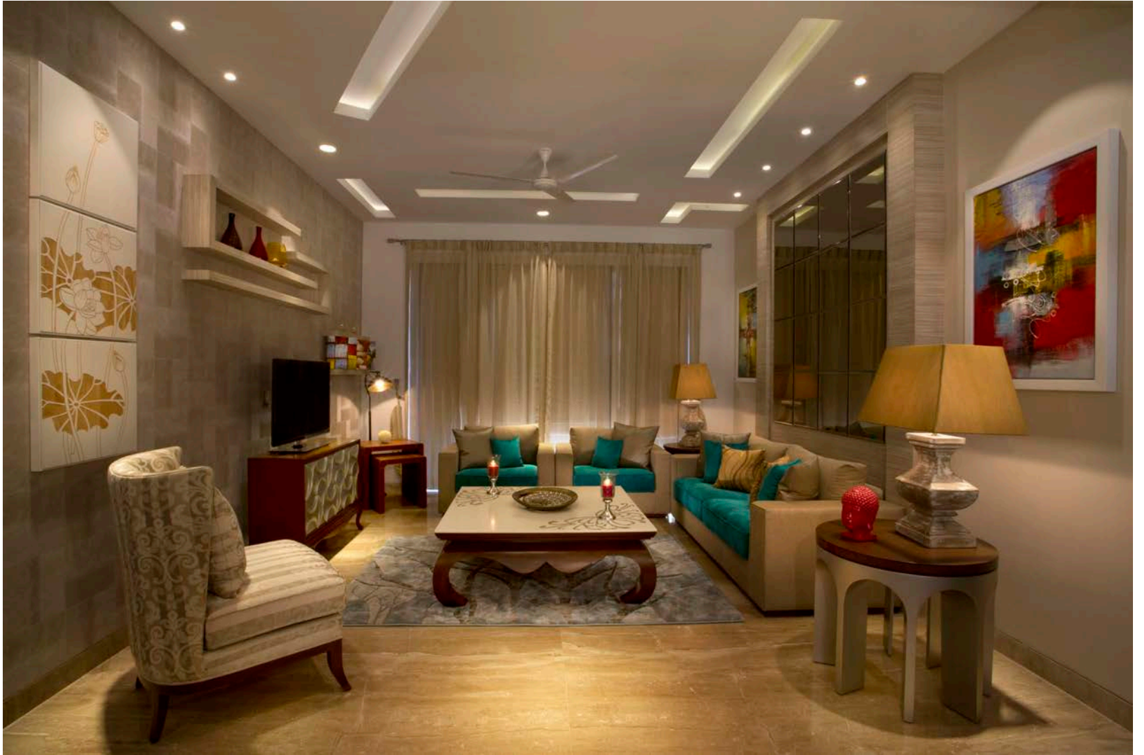
Actual sample flat image