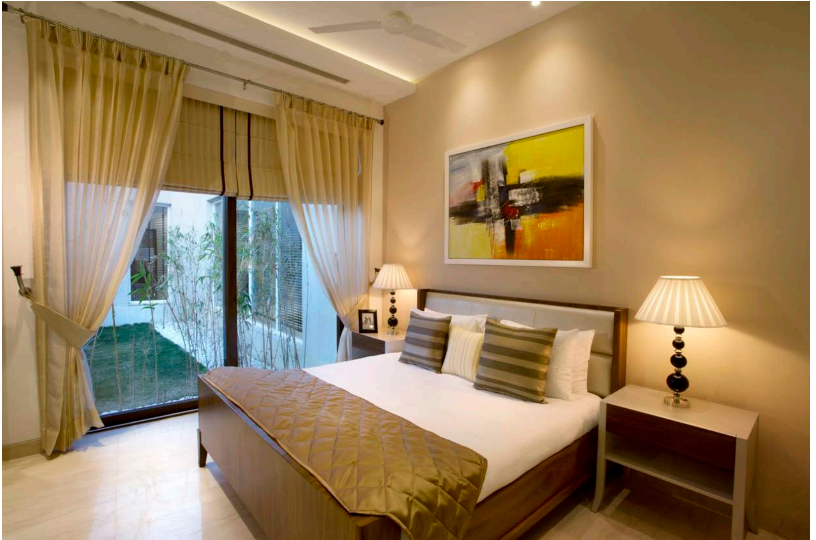
Actual sample flat image