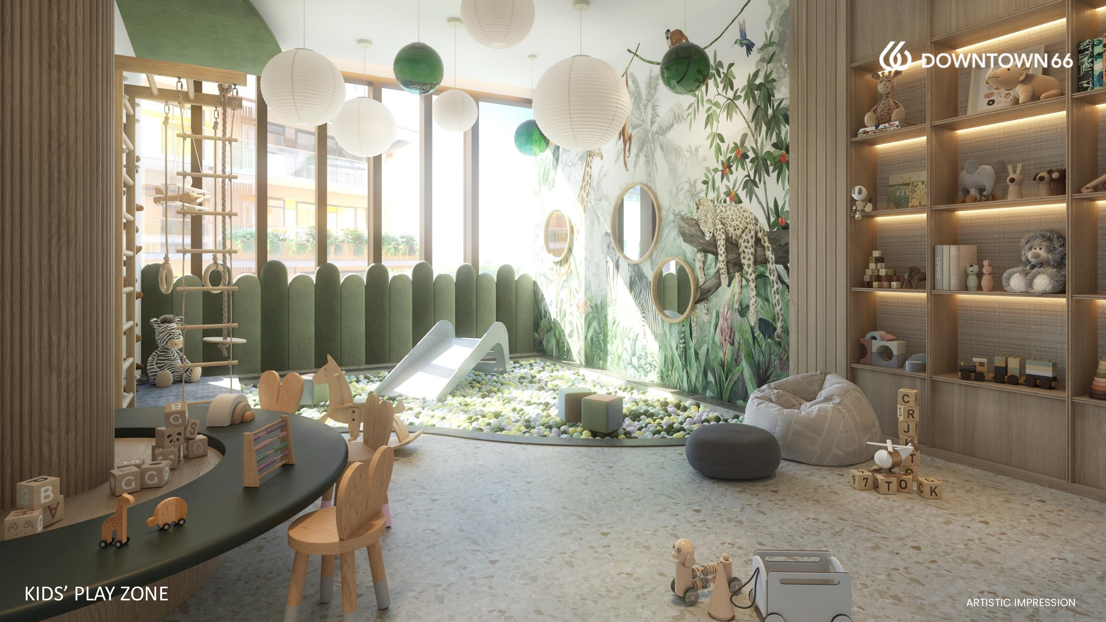
KIDS' PLAY ZONE